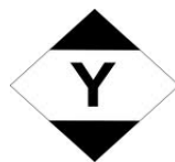
Figure 2. Limited Quantities Mark

According to the IATA DGR, mark the proper shipping name (with technical name), UN ID number, and net quantity of dangerous goods contained in the package on the outer packaging, near the shipper and receiver’s full name and address. Affix the Limited Quantities Mark (shown in Figure 2) and a hazard warning label for the material (e.g., a “Hazard Class 9 - Miscellaneous” label for Aviation regulated liquid, n.o.s.) to the outer packaging. Place these on the same surface as the proper shipping name, near the shipper and receiver’s name and address. If the package contains a liquid, ensure the package is marked with “Package Orientation” markings. Both a “Shipper’s Declaration for Dangerous Goods” and an Air Waybill are required.