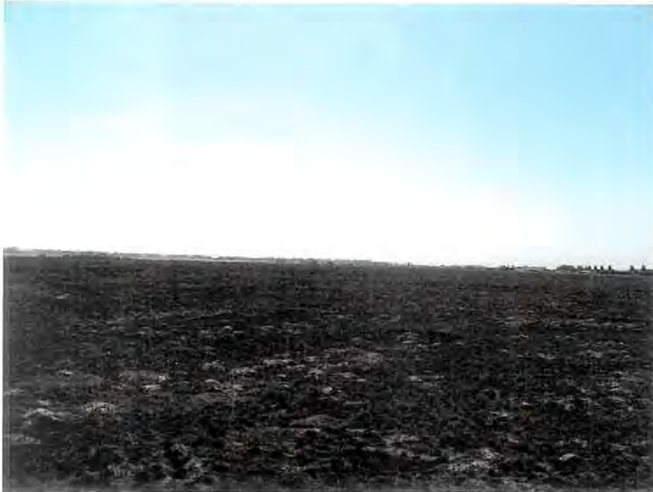
Figure 4. View of rodent burrow in Northwest Area.