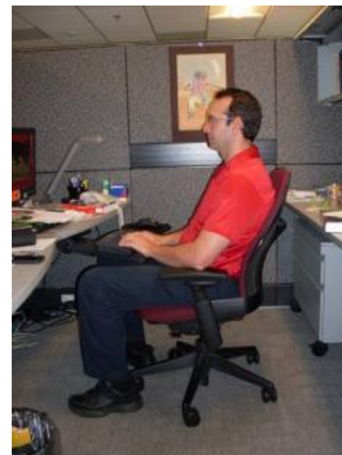
After Step 8