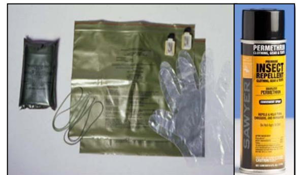
Left: Components of the IDA kit. Right: 0.5% permethrin spray can. Both are available through the DOD's supply system.