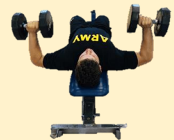
Dumbbell Chest Press