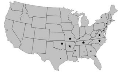
Distribution of known cases of Alpha-Gal Syndrome, from Commins, et al. 2011

Alpha-Gal Syndrome, also known as mammalian meat allergy or red meat allergy, is a recently discovered allergic reaction to red meat (beef, lamb, pork, venison, rabbit, and so forth) and other products made from mammals (including some medications, cosmetics, vaccines, gelatin, and milk products). Alpha-gal is a sugar molecule not found in humans, fish, reptiles or birds but present in the cells of most mammals. Growing evidence suggests that this reaction may be associated with a tick bite. Alpha-gal has been found in lone star ticks ( Amblyomma americanum ) and blacklegged ticks ( Ixodes scapularis ) in the United States, but it can be found in other tick species in Europe, Australia, and Asia. At this time, more research is needed to better understand who is at risk for developing Alpha-Gal Syndrome and how tick exposure contributes.